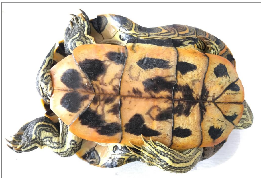
Figure 5. High quality image of the ventral of M. rivulata detected from the Atikhisar Reservoir