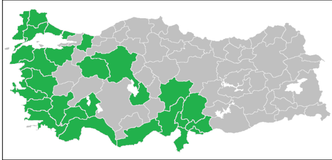
Figure 1. Spatial distribution of M. rivulata in Turkey (Anonymous, 2021)

al., 1998; Tok, 1999; Ayaz & Budak, 2008; Güçlü & Türkozan, 2010; Yılmaz & Tosunoğlu, 2010; Çiçek & Ayaz, 2011; Tosunoglu et al., 2011; Baran et al., 2012; Ege et al., 2015; Sarıkaya, 2015; Tosunoğlu et al., 2017).