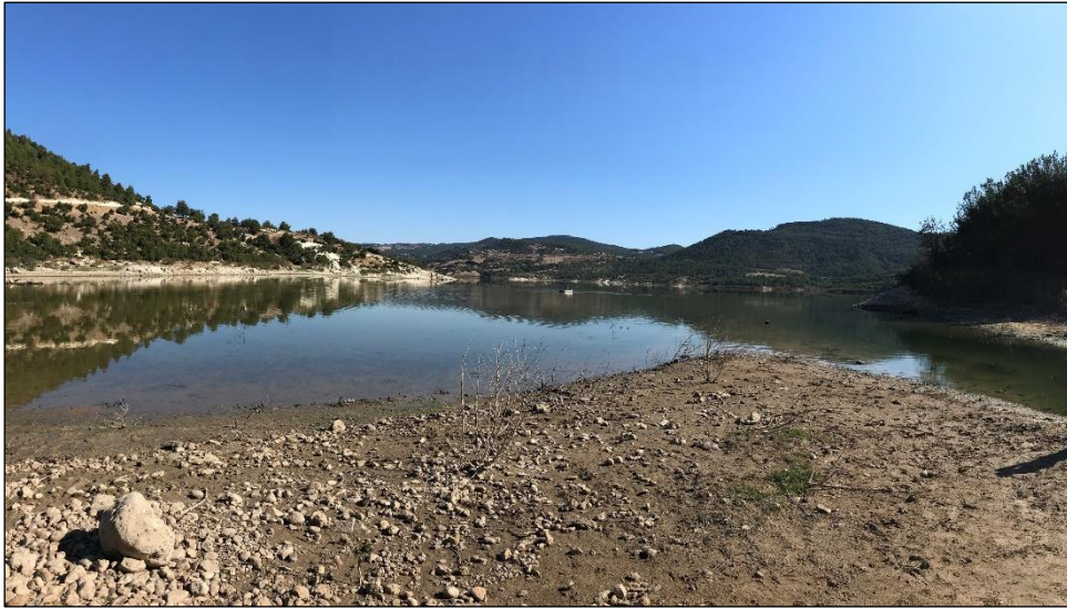
Figure 3. General view of the sampling location of M. rivulata in the Atikhisar Reservoir